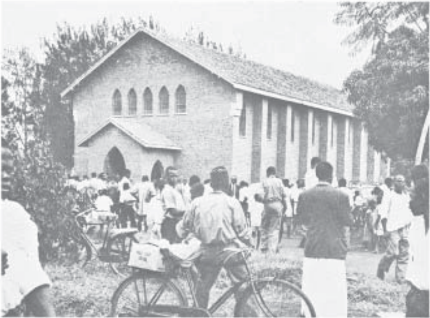
Each year thousands of Ugandans gather at Namugongo, at the spot where Blessed Charles Lwanga was martyred. They pray that Charles and his companions will soon be canonized.